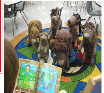
Bison Herd—Artsjunktion supplies Wellington School

Monday 12-5 pm Wednesday 1-5 pm Thursday 1-5 pm Saturday 10-2 pm. Closed on Statutory Holidays.